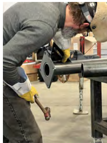
Hand crafted at B & W